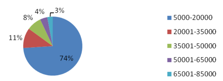
Figure 1.2 Amount of loans availed by fishermen (In Rupees)

While 3% fishermen had accessed loans up toRs.65000 to Rs. 85000, seventy four per cent have borrowed up to Rs.5000 to Rs.20000.